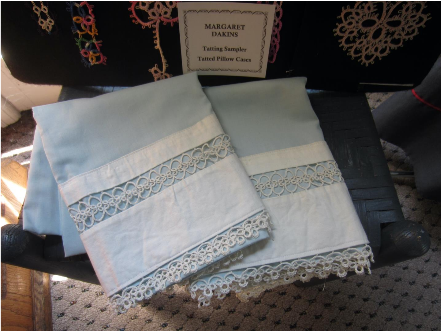
Tatting sample board and pillow case trim