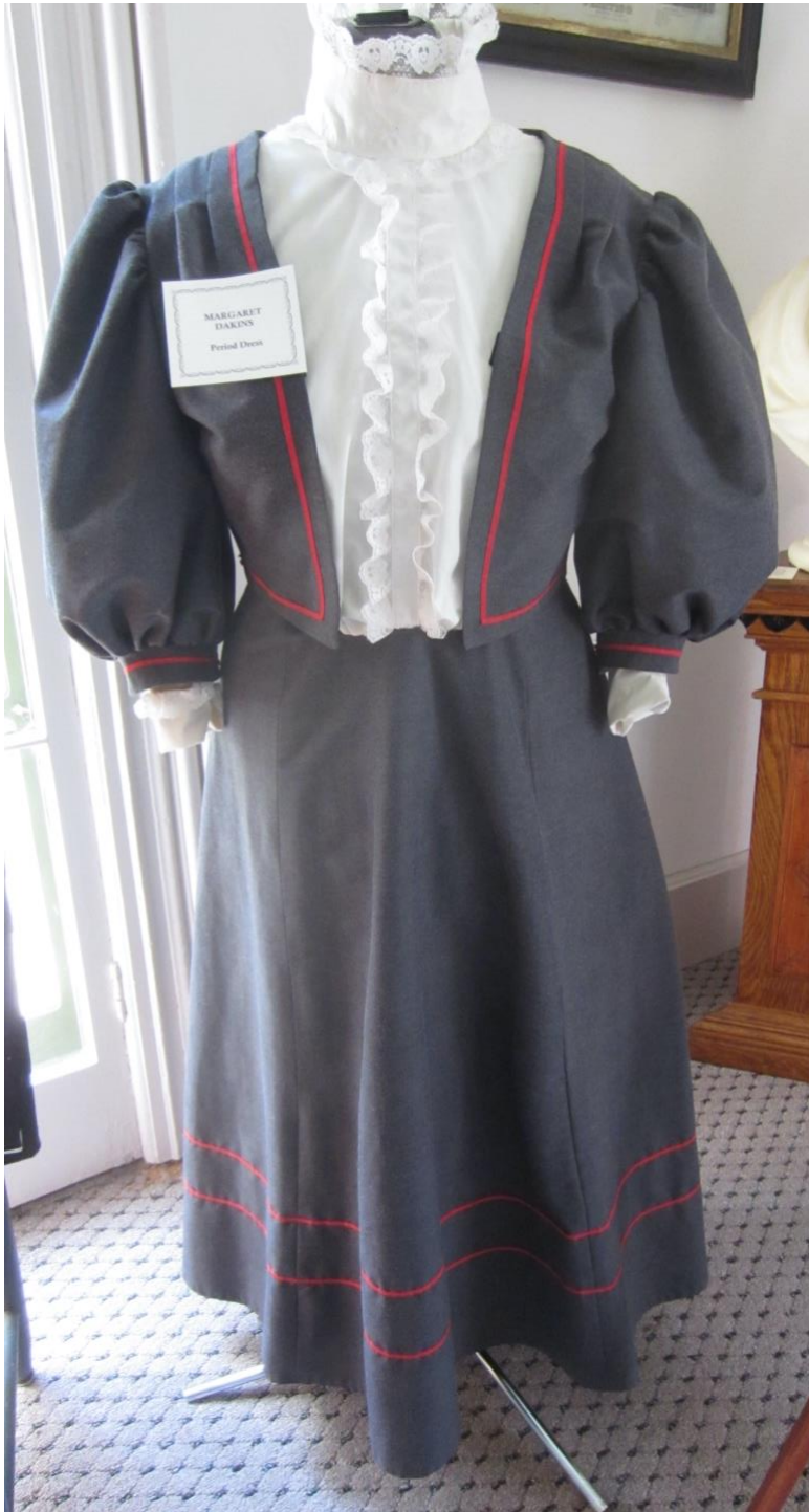
Period dress made for Sue Cross